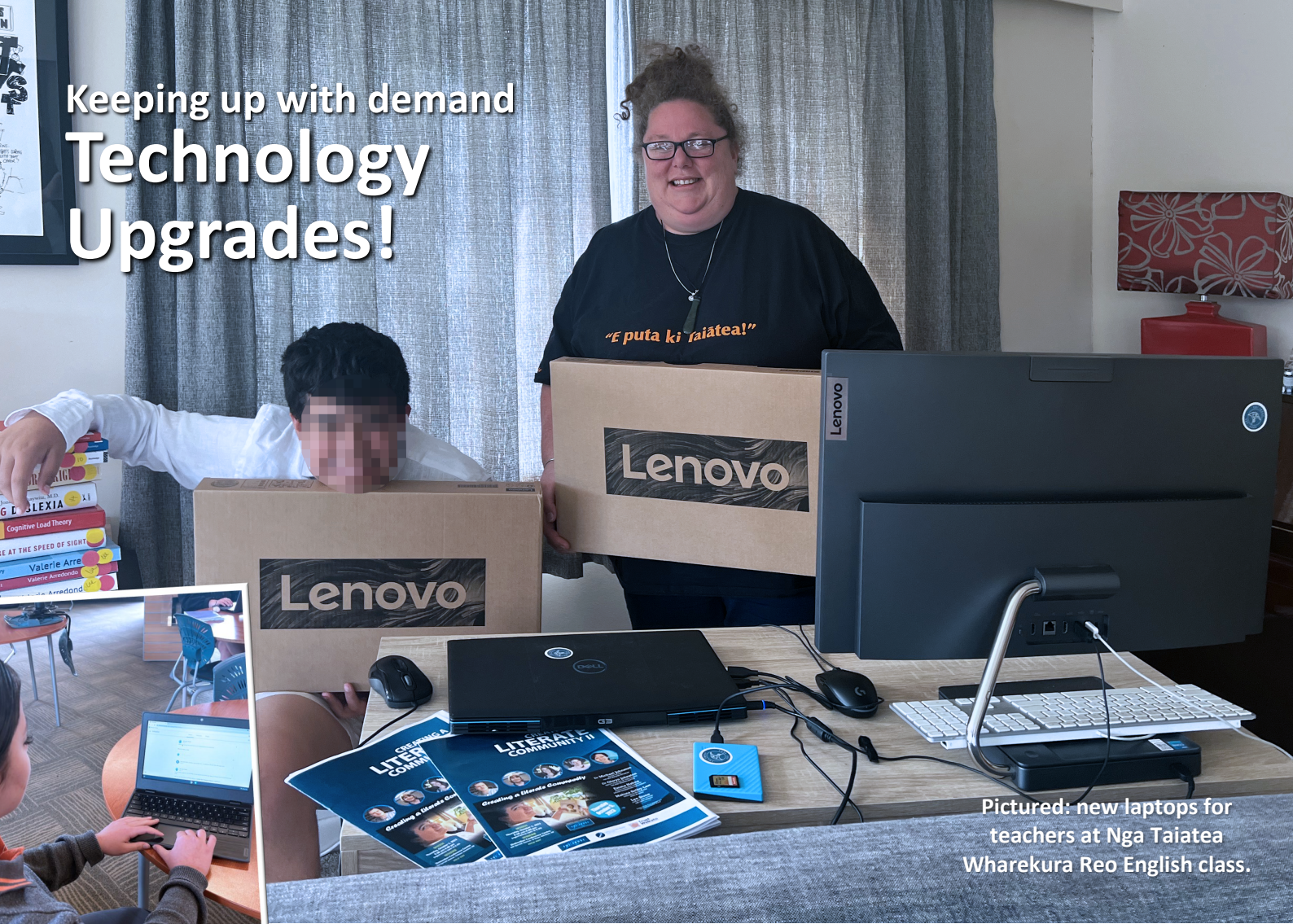
Pictured: new laptops for teachers at Nga Taiatea Wharekura Reo English class.