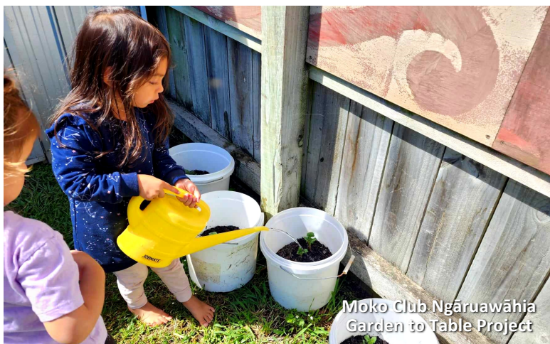
Moko Club Ngāruawāhia Garden to Table Project