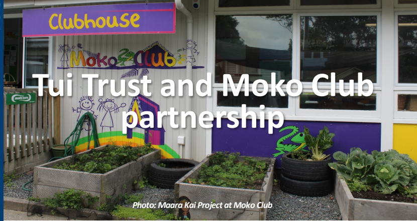
Photo: Maara Kai Project at Moko Club