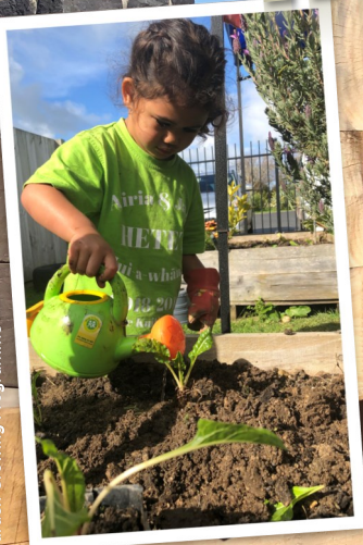
Photos: background image—Captain Compost planter boxes; right—Moko Club Ngāruawāhia Garden Growing Programme

Growing Food with Confidence Helping Moko Club kids grow, nurture, harvest, cook and share fresh food