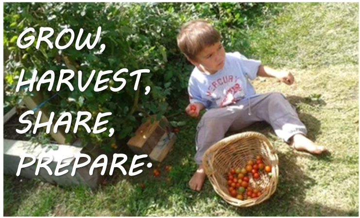
Pictured above and top: Moko Club Ngāruawāhia—Gardening Growing Programme

For funders, businesses or individuals that would like to partner or donate materials we will acknowledge your business on our website and publications. For further information or you would like to donate wood please email