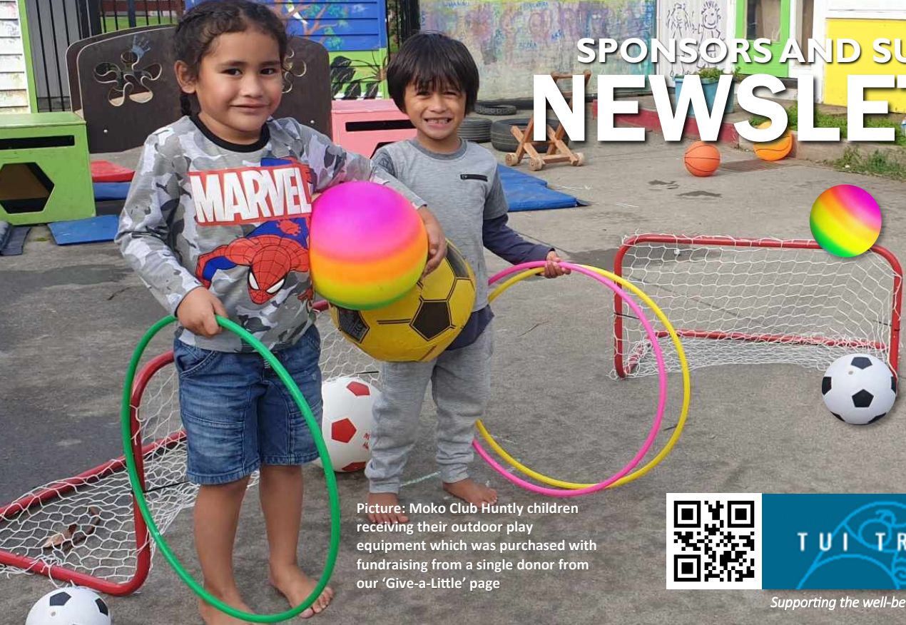
Picture: Moko Club Huntly children receiving their outdoor play equipment which was purchased with fundraising from a single donor from our 'Give-a-Little' page

Our Newsletter contains the latest information on who and where we're helping, our projects and campaigns, along with ideas about supporting children with additional needs