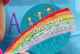
Photo: Moko Club Huntly tamariki turning five years old receive a School Starter Pack from SSFI—School Start First Impressions.

TUI TRUST Supporting the well-being of children